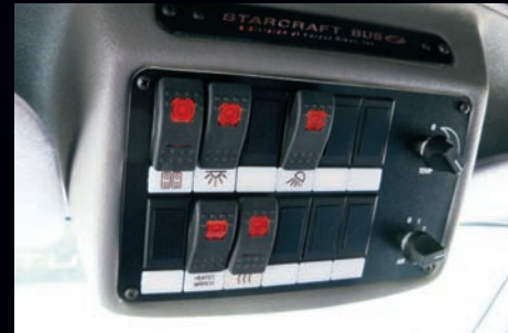
Driver's switch panel conveniently located within driver's view of the road