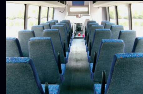
Large panoramic solid windows offer the best view for every passenger