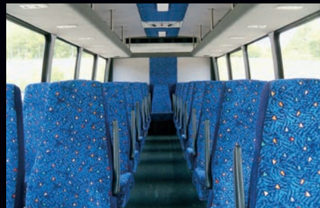
Optional 19" wide high back seats, armrests, cloth upholstery offers a comfortable ride for all passengers