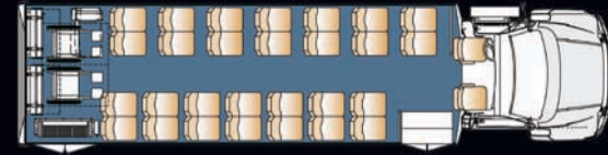
29 Passenger Plus 2 Wheelchair Positions Plus 2 Passenger Foldaway and Two 2-Passenger Flipseats