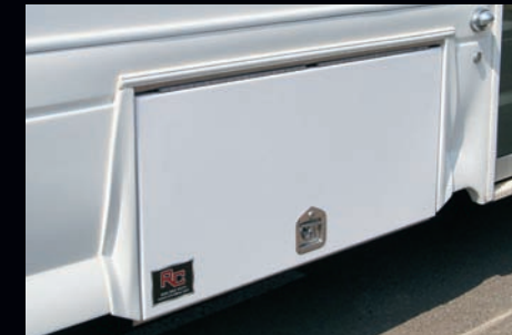
Optional skirt mounted storage pod for storage of beverages, snacks, or the sport teams extra gear