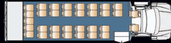
32 Passenger Plus Rear Luggage