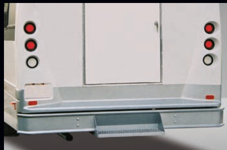
Standard fiberglass rear cap and steel rear bumper with rear step for ease of loading luggage into luggage area