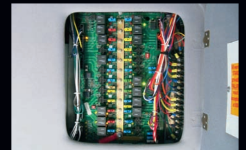
Printed electrical circuit board with LED trouble-shooting lights