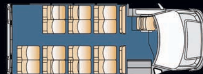
14 Passenger with Activity Bus Seats