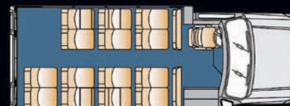
14 Passenger with Activity Bus Seats