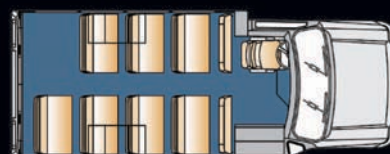
14 Passenger with School Bus Seats