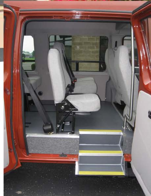
Heavy Duty Steel Z-Step Curb Side Entry With Running Boards