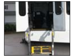
Rear Wheel Chair Lift