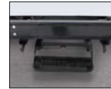
Rear Step & Tow Hooks