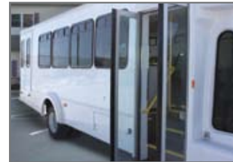
High Gloss Exterior Fiberglass