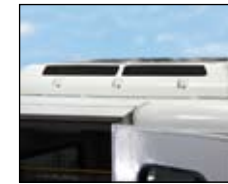
Rooftop Mounted AC