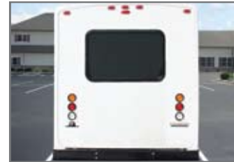
Rear Window (shown with optional light package)