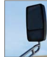
Breakaway Convex Mirrors