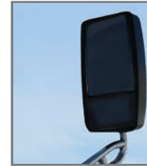
Breakaway Convex Mirrors