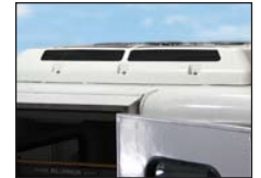
Rooftop Mounted AC