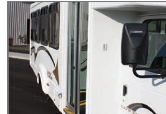
High Gloss Exterior Fiberglass