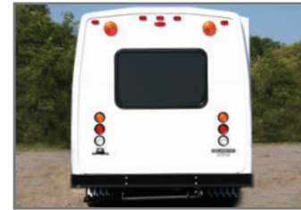
Rear Window (shown with optional light package)