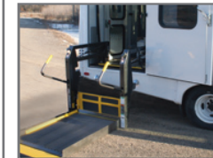
Rear Wheel Chair Lift