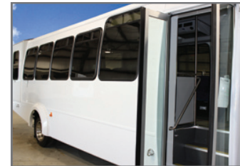
High Gloss Exterior Fiberglass