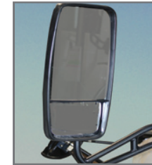
Breakaway Convex Mirrors