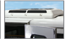
Rooftop Mounted AC*