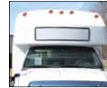
Front Cap with all LED Lighting