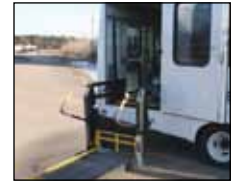
Rear Wheel Chair Lift