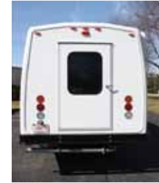
Rear Wall (shown with optional rear door & center brake light)

Due to constant product improvements; specifications, component parts and optional equipment are subject to change without notice or obligation. See your dealer for details. Photos may show optional equipment.