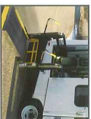
Rear Wheel Chair Lift