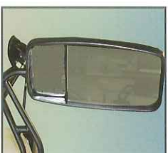
Breakaway Convex Mirrors

Due to constant product improvements, specifications, component parts and optional equipment are subject to change without notice or obligation. See your dealer for details. Photos may show optional equipment.