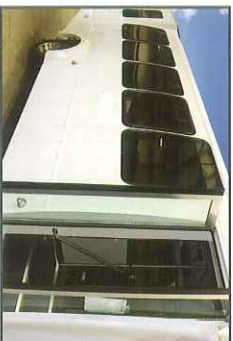
High Gloss Exterior Fiberglass