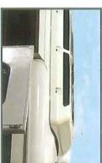
Rooftop Mounted AC