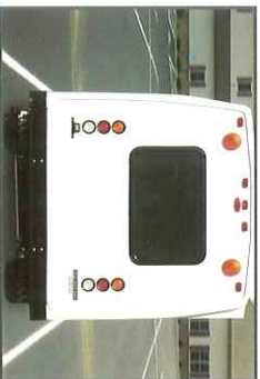
Rear Window (shown with optional light package)