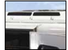
Rooftop Mount AC