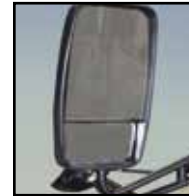
Breakaway Convex Mirror

Due to constant product improvements, specifications, component parts and optional equipment are subject to change without notice or obligation. See your dealer for details. Photos may show optional equipment.