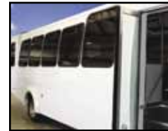
High Gloss Exterior Fiberglass