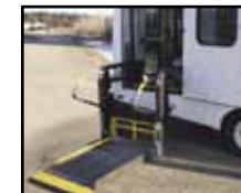
Rear Wheel Chair Lift