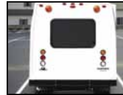
Rear Wall (shown with optional light package)