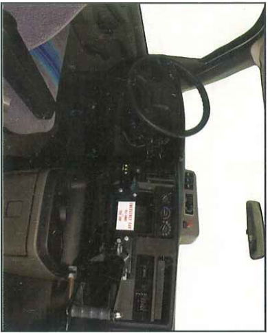
Convenient driver controls are easily accessible.