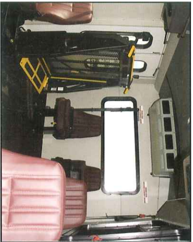
ADA packages available.