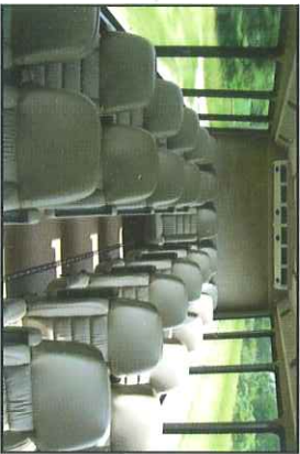
A variety of seating packages are available.