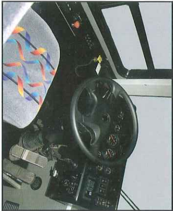
Convenient driver controls are easily accessible.