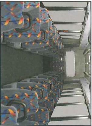
Available in 96" or 102" wide body widths for seating flexibility.