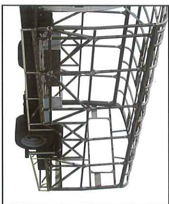
1 1/2" X 1 1/2" Steelguard® construction provides superior durability.

NOTE: Champion Bus Inc. reserves the right to make changes at any time in prices, colors, materials, equipment, design specifications and models, and also to discontinue models without notice and/or obligations. Data shown is basic information for the prospective Buyer effective at the time of issuance of this literature. Dealer will provide complete up-to-date information on available equipment specifications, etc., not shown here. Items referred to as "options" or are "available" are at extra cost.