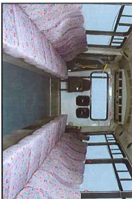
A variety of seating packages are available.