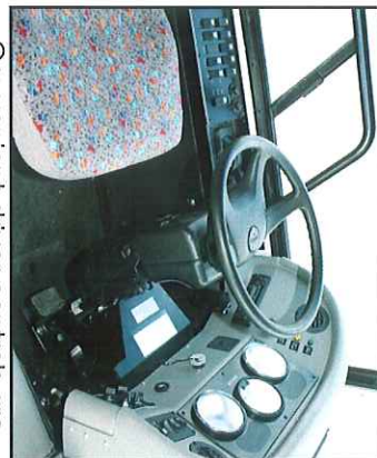
Convenient driver controls are easily accessible.